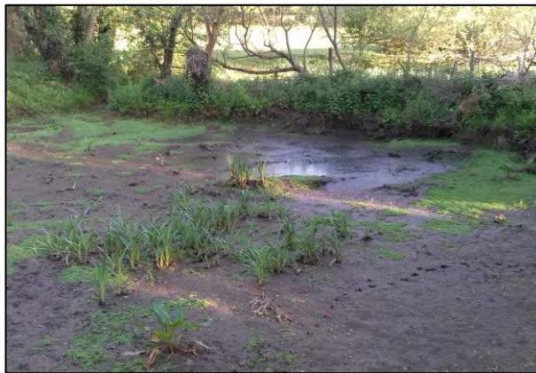
Photo 6. Pond 18, dry throughout surveys.