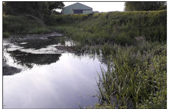
Photo 7. Pond 1, found to be too dry to survey on 25 April 2019.