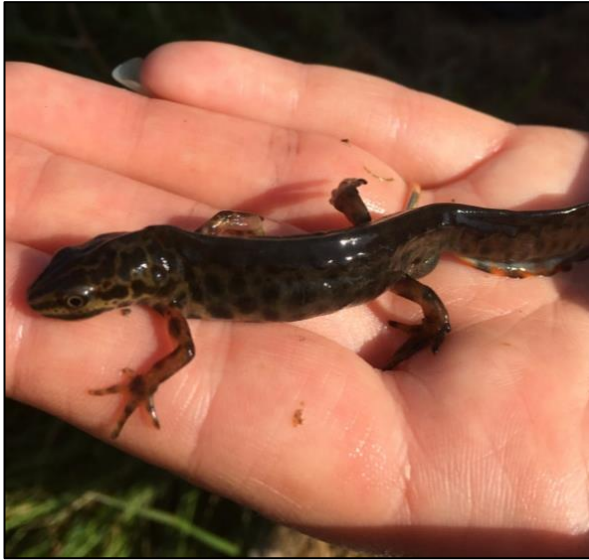
Photo 1. Male smooth newt, pond 25