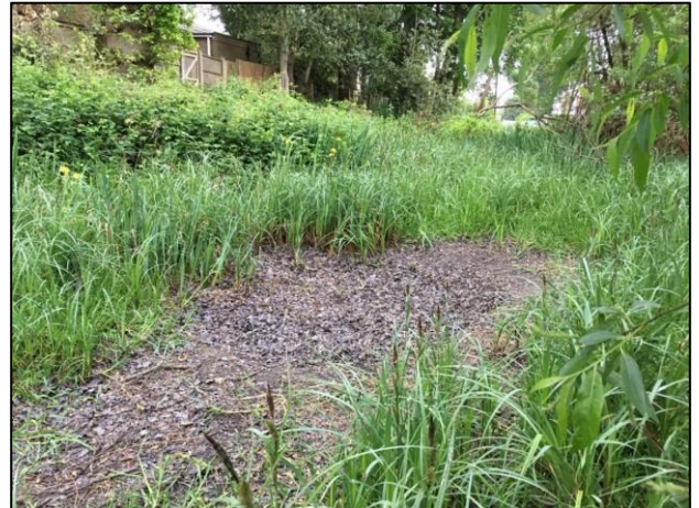
Photo 5. Pond 23