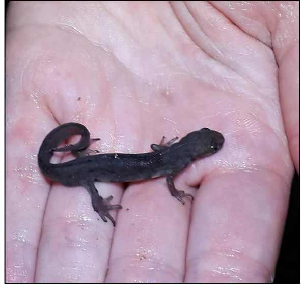
Photo 2. Juvenile smooth newt